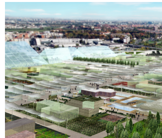
Expo 2015 Render