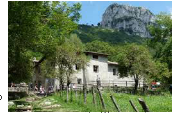
terz'Alpe mountain retreat

18:00_ Leaving for Malpensa airport by car 21:25_ Departure for Bilbao