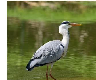
Lipu Oasis Park