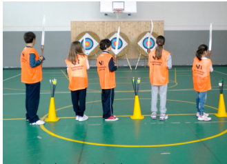
Leonardo da Vinci School

07:45_ Arrival at school Socializing activities with the whole class 2E 08:30_ Archery at school and "Let's play in the gym!" 09:45_ Breaktime