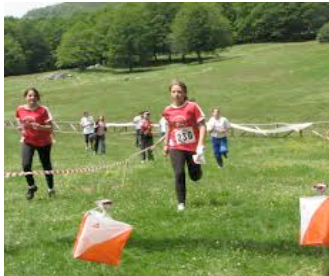
Orienteering at Oaks Park